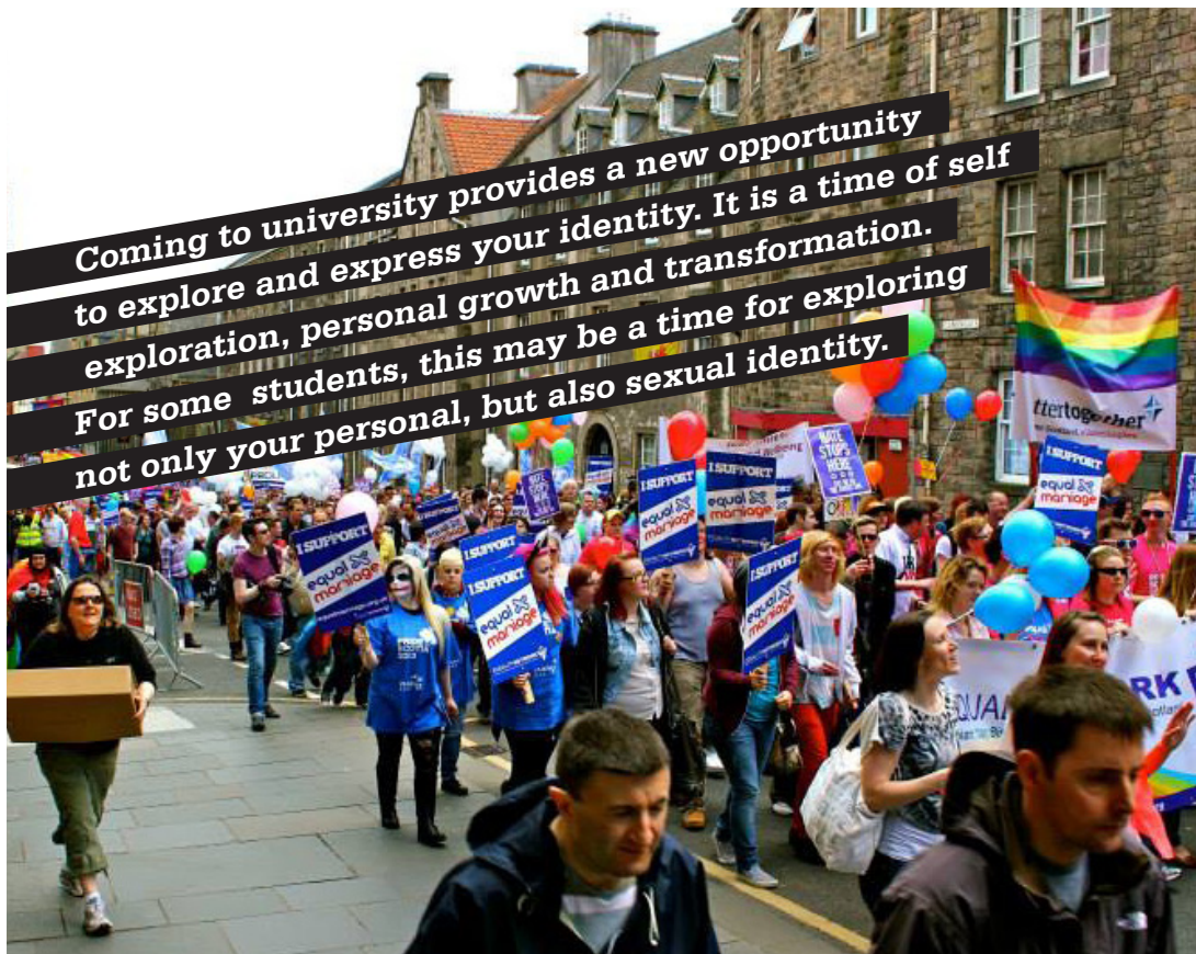
Pride march, Edinburgh

Being gay, lesbian, bisexual, or just not sure can be difficult in a hetero-normative society. You may not have had many opportunities to think what it means for YOU to be LGB or to talk with others in a supportive environment about how you feel about this.